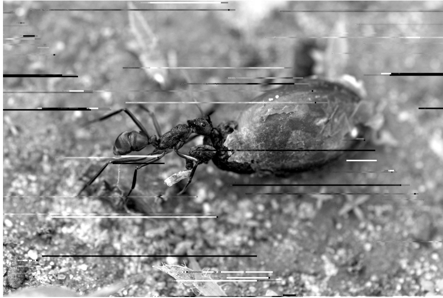
PLATE 1. A Rhytidoponera aurata worker transporting an Acacia dunnii seed in tropical savanna woodland outside Darwin, northern Australia. The worker is dragging the seed by the elaiosome. This is a large ant (8 mm length) and a large seed (12 mm length, 302 mg).

seeds in habitats dominated by the invasive Argentine ant, Linepithema humile , rarely escape the parental canopy and remain vulnerable to small-mammal predators (Bond and Slingsby 1984). Perhaps as a result, seedlings in invaded habitats are poorly dispersed and less than 1/10 as abundant (Bond and Slingsby 1984), in some cases even leading to local extinctions of plant species (Christian 2001). Why these problems occur, and whether we might expect similar disruption of this ant-plant mutualism after invasions by other exotic ants, is not yet well understood.